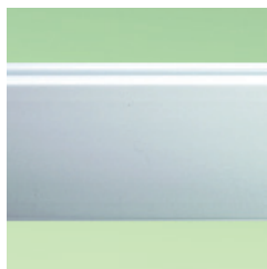
clear anodized aluminum