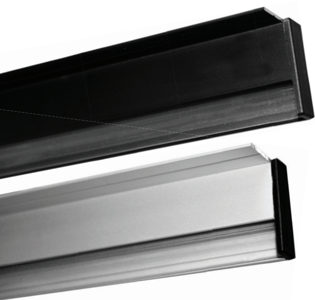
AnoGotcha Plus QR with Flange allows for direct-to-ceiling mounting.