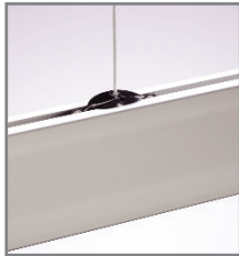
06-5050 Cable Clip Black or clear