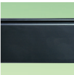
black anodized aluminum