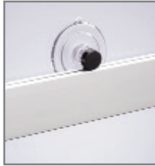
20-0038 Window Mounts Clear with black or clear cap