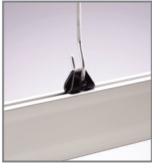
1UP-0101 MultiClip Black or clear