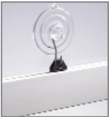
06-SC150H Suction Cup Clear with nickel plated steel hook