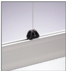
06-5045 QuickClip Black, silver or clear