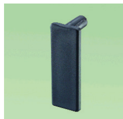
06-5585-B Square Replacement End Caps Black

2 End Caps are included with each holder.