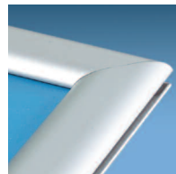
12AS100R clear anodized aluminum round profile