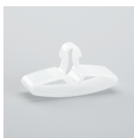
06-6065 Butterfly Track Hangers White 2 Hangers are included with each Cross Bar.