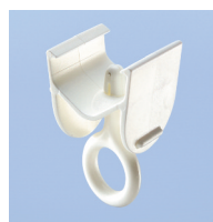
25-0365-W Butterfly Clip with Ring