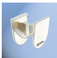
25-0364-W Butterfly Clip with Cable/Cord hole