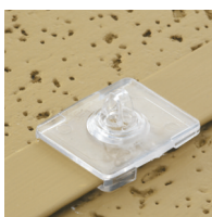
RAN-MM Mighty Mite Anchor for Hooks