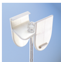
25-0363-W Butterfly Clip with hole