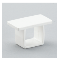
06-5485 Butterfly Track Replacement End Caps Silver or white 2 End Caps are included with each track.

All Butterfly Track orders are cut to your exact specifications. Call for pricing.