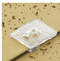
RAN-MM-CC Mighty Mite Anchor for Cable and Saucer or Ball Chain