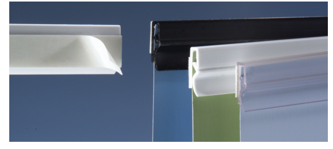
12G100NRT Gotcha® with Adhesive Clear transfer film available. Call for pricing.