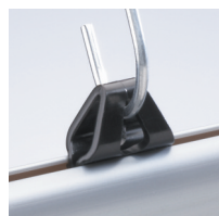
1UP-0101 MultiClip Black or clear

Suction cups are not recommended for use with heavier QuickGrip installations. Call for recommendations.