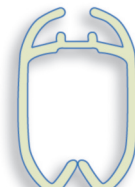
Shown actual size