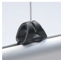
06-5045 QuickClip Black, silver or clear