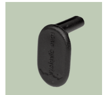
06-5525 Round Replacement End Caps Black 2 End Caps are included with each holder.

Always cut to your exact specifications.