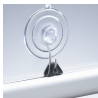
06-SC150H Suction Cup Clear with nickel plated steel hook