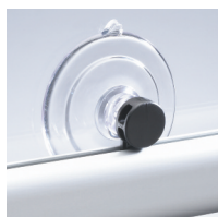
20-0038 Window Mounts Clear with black or clear cap