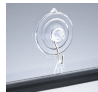
06-SC150H Suction Cup Clear with nickel plated steel hook

Suction cups are not recommended for use with heavier Slim Holder installations. Call for recommendations.